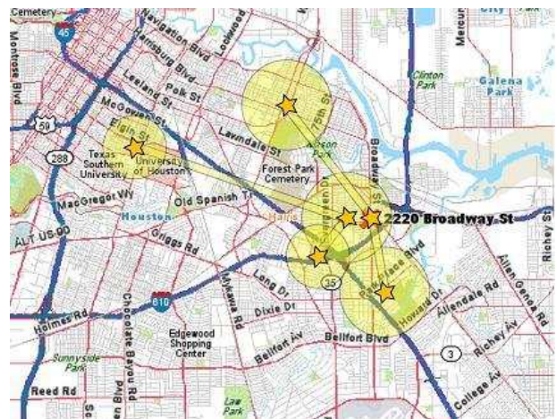
Fig. 3. Potential future expansion to 15 square kilometers of wireless coverage for Houston's East End neighborhoods.

Measurement Study. A vital step in the development of our research platform will be automating a means to perform experiments and record measurements. We will employ SNMP and tcpdump in our network to monitor traffic statistics of users within the network. Also, we will emulate important multihop scenarios using traffic gener-